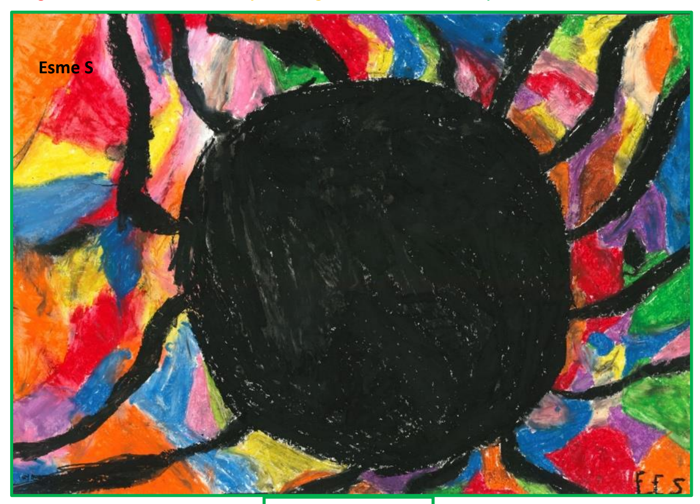
Artwork from Yr 5